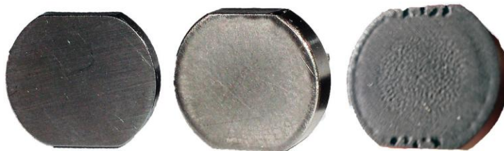
Figure 3. Surface appearance for removable ½” flat tip, ranging from pristine (left) to matted (center) to badly eroded with pitting (right).

If the probe’s tip is removable, frequent operation may eventually loosen the tip resulting in a lower acoustic power conversion and energy yield. The probe tip should be periodically inspected, and if necessary retightened.